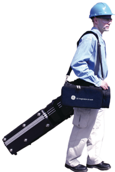
TransPort PT878GC portable flowmeter and accessories

The new meter was tested extensively on metal pipes with diameters as small as 0.75 inches and as large as 24 inches. This meter is suitable for measuring the flow of air, hydrogen, natural gas and many other gases.