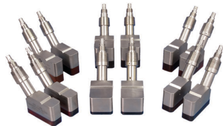
GE's technologically advanced clamp-on gas ultrasonic transducers

The new line of clamp-on gas transducers produces signals that are five to ten times more powerful than those of traditional ultrasonic transducers. The new transducers produce clean, coded signals with very minimal background noise. The result is that the TransPort PT878GC flowmeter system performs well even with low-density gas applications.