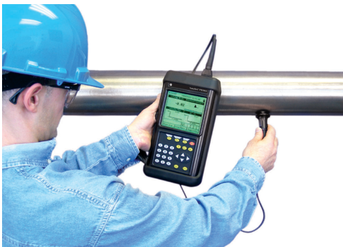
Optional pipe wall thickness gauge

Pipe wall thickness is a critical parameter used by the TransPort PT878GC flowmeter for clamp-on flow measurements. The thickness-gauge option allows accurate wall thickness measurement from outside the pipe.