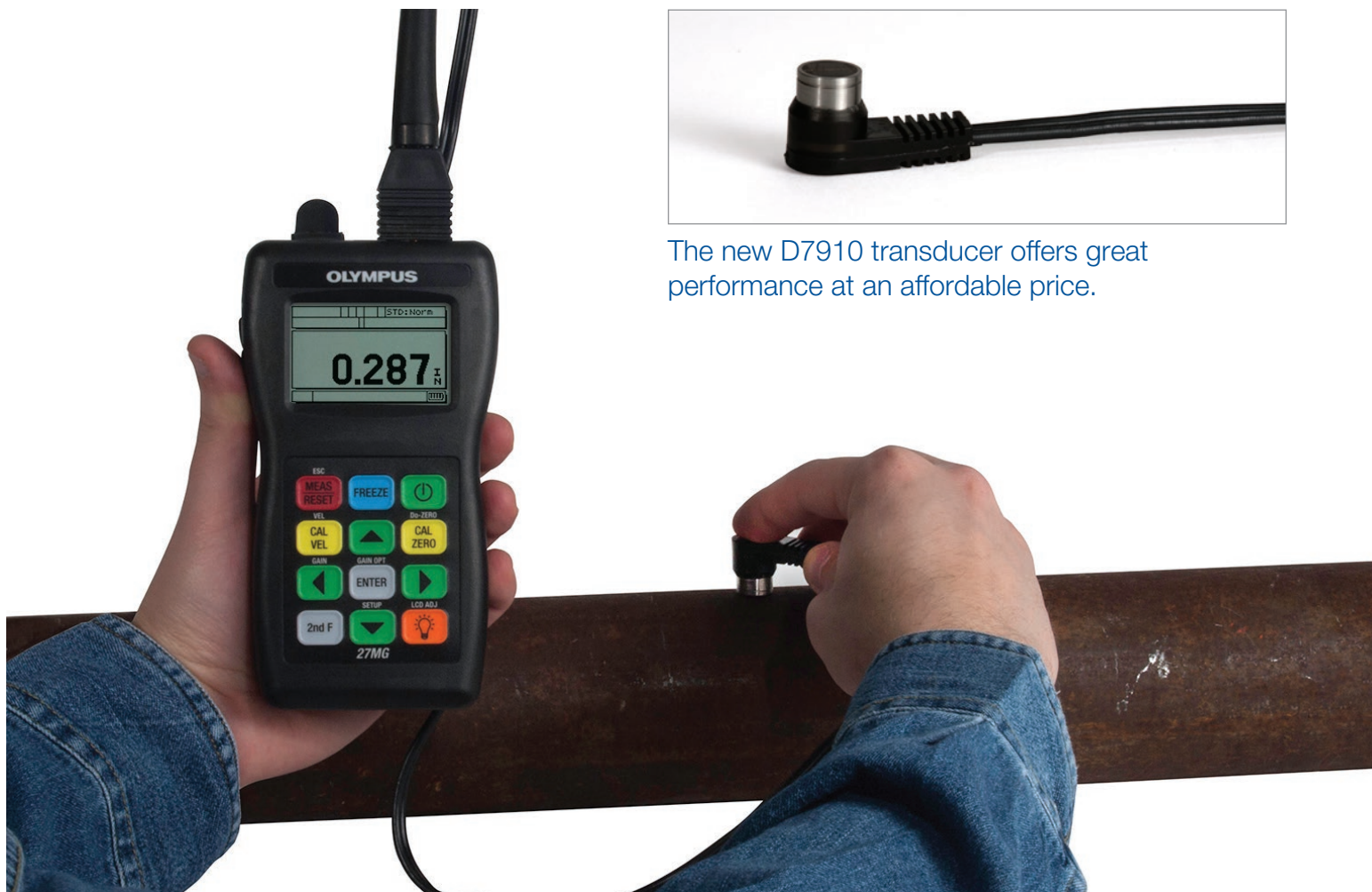
The new D7910 transducer offers great performance at an affordable price.

The 27MG comes standard with the low-cost D7910 dual element transducer that enables you to make thickness measurements for many basic corrosion applications. For measurements on very thin or thick materials, or small diameter pipes, Olympus has available a full line of dual element transducers. Olympus transducers compatible with the 27MG feature Automatic Probe Recognition that optimizes transducer performance by automatically recalling the default V-path correction.