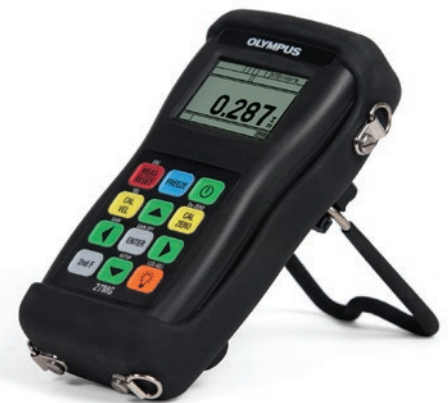
27MG with the optional Protective Rubber Boot with Neck Strap and Gage Stand

For additional accessories such as holders, wands, and couplants, please consult Olympus.